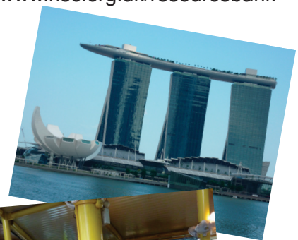
Images of Singapore