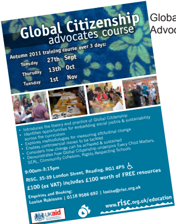
Global Citizenship Advocates Course