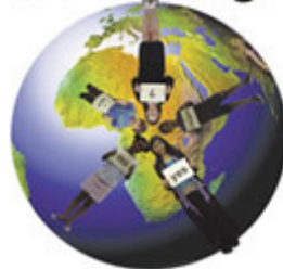
a toolkit for measuring attitudinal change in global citizenship from early years to KS5