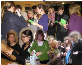
An action-packed introduction to Global Citizenship & the range of services RISC offers to schools. Participants will explore what taking action for social justice and sustainability is all about, within & beyond the classroom - & why it's an essential part of encouraging children & young people to be active Global Citizens.

Thursday 10 June 1-4pm risc 35-39 London St RG1 4PS £ FREE for NQTs UKaid www.risc.org.uk/education